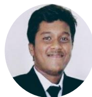
S SHIVA 5/5 BA LLB